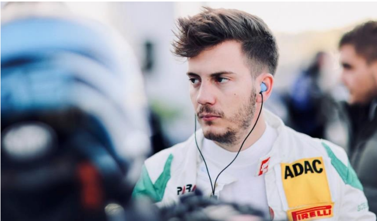
Image 2: F. Vettel in racing action