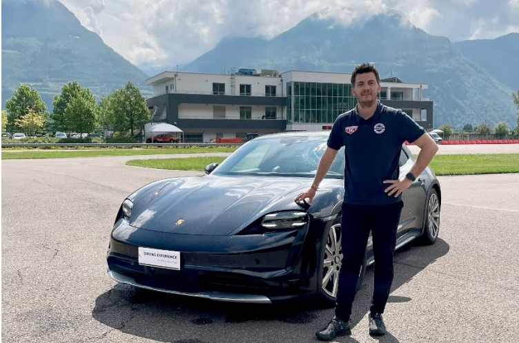
Image 1: Brand ambassador F. Vettel in action at the Safety Park Südtirol